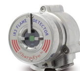
SharpEye 40/40 Series Flame detectors