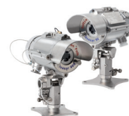
SafeEye 900 Series Open Path gas detectors